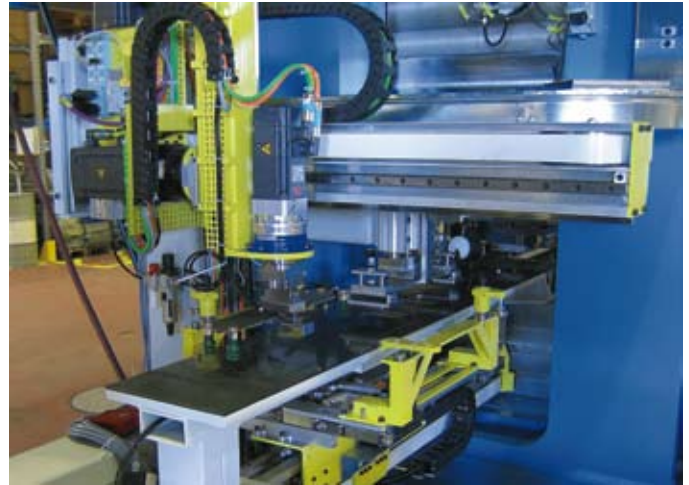
CD 20 Rotary motion