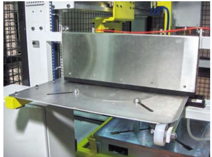
Lubrication unit – Shuttle